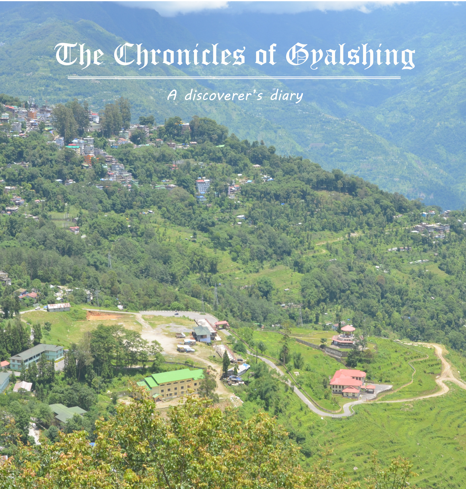
View of Gyalshing